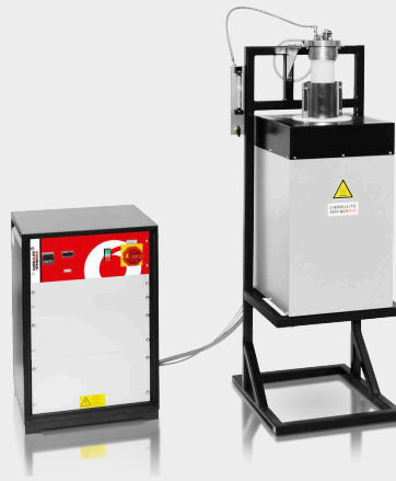
HTRV 18/100/500 with optional inert gas package and ceramic tube closed on one side