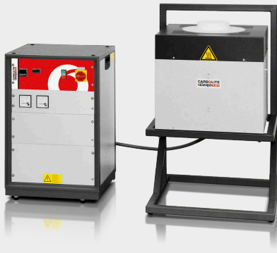
HTRV 17/150/250 with optional L-stand