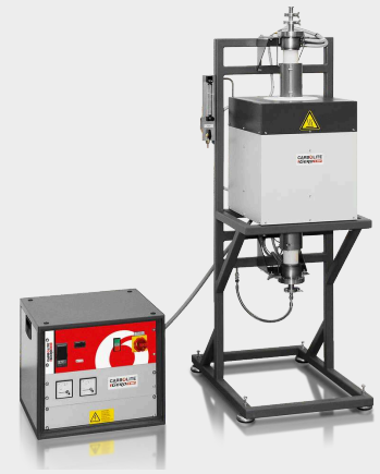
HTRV 18/70/250 with optional inert gas package, high vacuum flanges, E3508P10 programmer and current/voltage display

Content may be subject to modifications or corrections