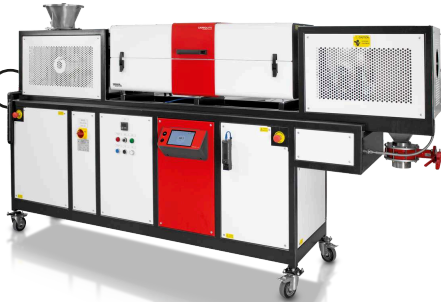
Rotating tube furnace TSR

Carbolite's TSR rotating tube furnace range incorporates the same innovations developed for the TS split tube furnace series with the equipment required to process large batches of free-flowing material, such as powders.