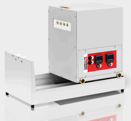
GK - Grijs King Cokes Test oven