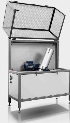
CSR - Coke sterkte na reductie I- Tester/Tuimelaar