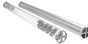
Standard quartz work tube and optional metallic work tube